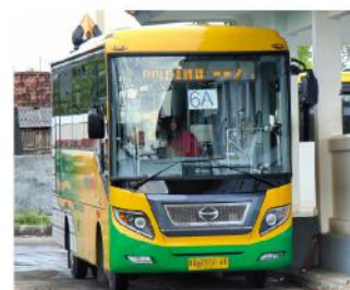
Transportation: US$7 to US$15