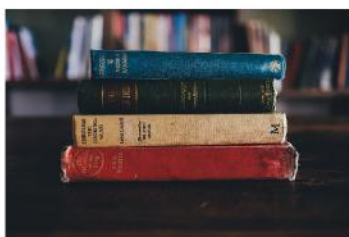
Textbook or Printing: US$4 to US$15