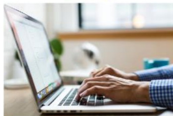
Internet: US$7 to US$15