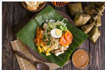
Food: US$65 to US$90