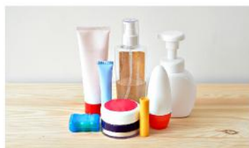
Toiletries: US$7 to US$15

Note: These are all average costs for students in Jogja, but it depends on the lifestyle of each student.